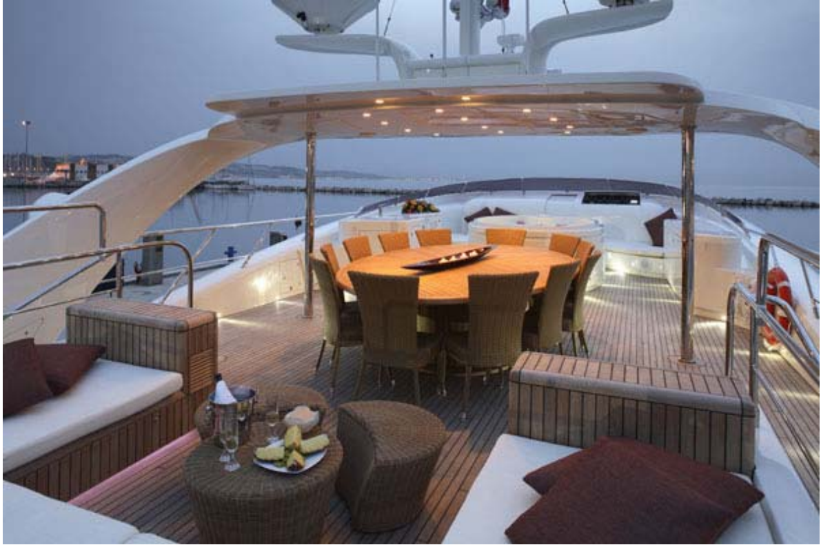
MAIN DECK LEVEL